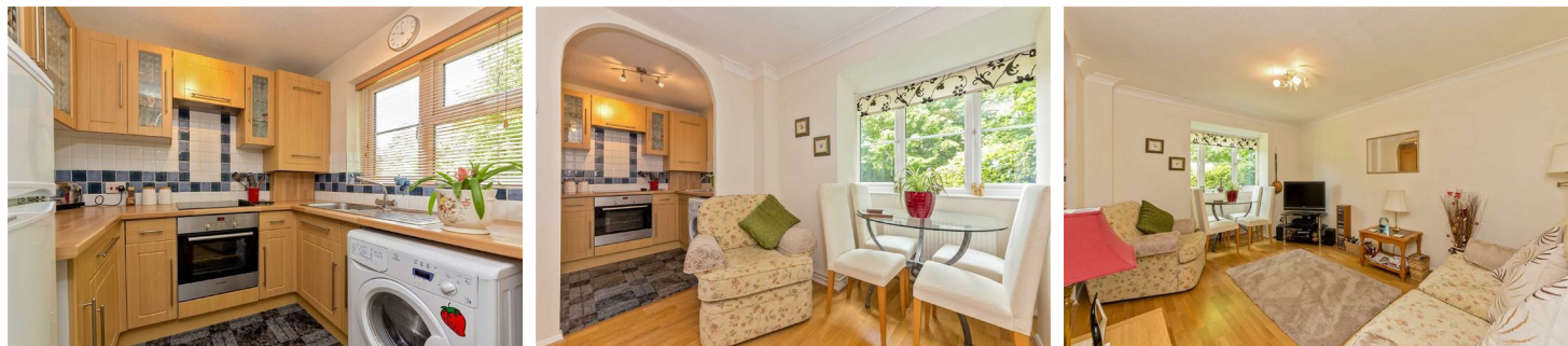
Ground Floor Approx. 36.7 sq. metres (394.8 sq. feet)

A tastefully refurbished ground floor flat situated close to good local amenities at the Quadrant parade in the ever popular area of Marshalswick. Offering bright and spacious room dimensions, the property enjoys a well balanced lounge/dining room, a modern fitted kitchen, one double bedroom and a stylish good sized bathroom. Further features include well tended communal grounds. Marshalswick is situated approximately 1.5 miles North East of St. Albans city centre, and enjoys the use of good local facilities including its own petrol station, Sainsbury's Local and a library to name but a few. St. Albans city centre with its extensive shopping and leisure facilities, and the mainline railway station, linking St. Albans to London, St Pancras, is only a short car or bus ride away.